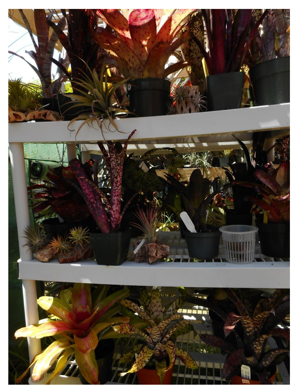
Neatly stacked broms in Morlane O'Donnell's collection.