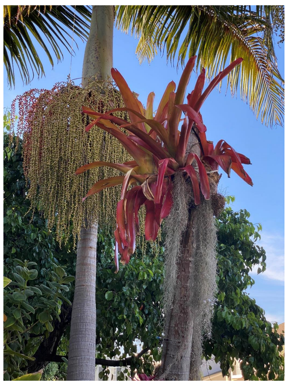
The blanchetiana tree in my front yard. The plant in the middle is the Wally Berg I just added.

I finally got around to going up my blanchetiana tree – a dead king palm that I outfitted with a crown of Aechmea blanchetiana orangeade and do some much needed clean-up. It was looking pretty shaggy after all the rain and wind that beat up on it recently. Dead leaves were trimmed, and the plants that were tilted were secured. Found two empty birds nests up there, which I was careful not to knock down. Overall, I'm glad to see that the plants are pupping, even in the adverse conditions. I added another blanchetiana to the ensemble, this time a 'Wally Berg'.